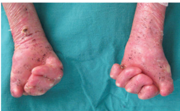
Figure 1 Preoperative photo of the patient.

The first dressing change was performed under sedation and anaesthesia 1 week after surgery. Epithelialisation islands on