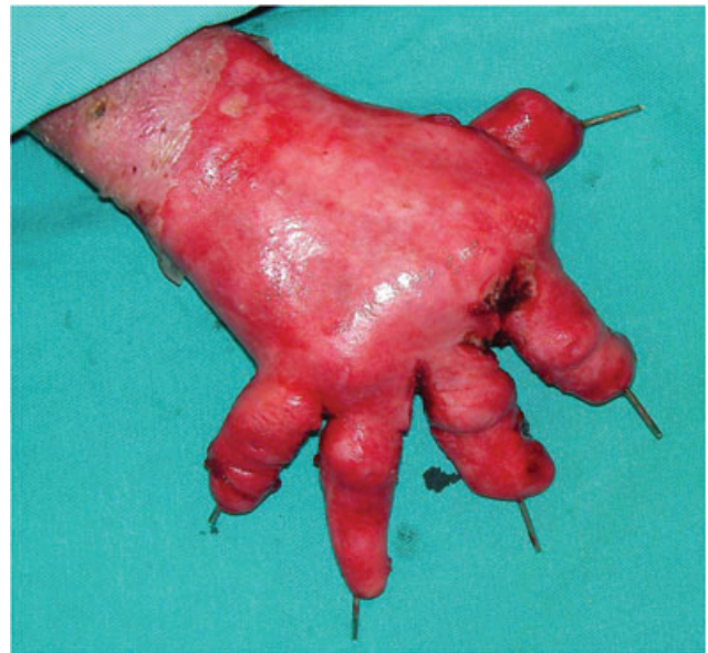
Figure 2 Intraoperative photo of the hand.

the fingers and dorsum of the hand were observed. Suprathel® remnants were not removed. Both the hands were washed with temperate saline. Vaseline gauze was used to cover all the surface of the hands. Saline-soaked gauze was placed on the web spaces and over the vaseline gauze. The web spaces were separated by wet sterile cotton. The hands were then covered with cotton bandage and thermoplastic volar splint was applied. Thermoplastic splint is of light weight with low friction surface and has memory allowing easy adjustment. Second dressing was performed 1 week after the first one. The redressing was performed in the same manner. Kirschner wires were removed. Epithelialisation was complete on both hands except a small ( 1 \times 2 \text{ cm}^2 ) de-epithelialised region on the dorsum of the hand (Figure 3A and B). At the end of the second week, range of motion exercises was performed under the direction of hand occupational therapist.